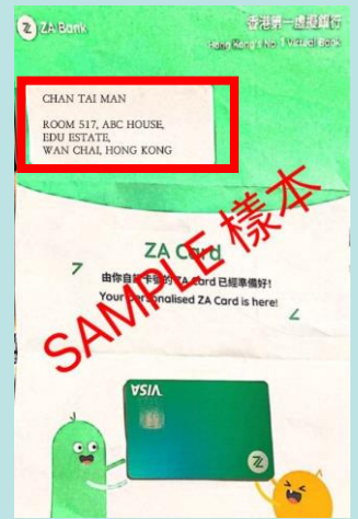
Address shown on the envelope