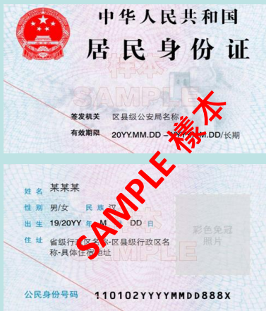
For students from the Mainland of China – Resident's ID card containing student's personal information