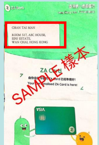
Address shown on the envelope