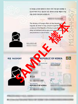
For students from other regions or countries – Passport containing student's personal information