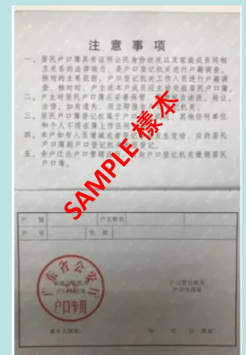
Mainland of China – Documents other than Resident's ID card