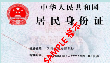
Mainland of China – Resident's ID card without containing student's personal information