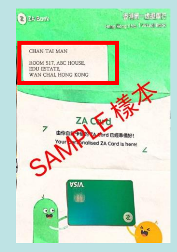
Address shown on the envelope