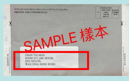
Address shown on the envelope