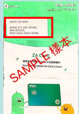
Address shown on the envelope