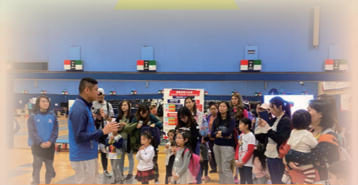
Coordinating a sports event at the Hong Kong Sports Institute (HKSII)