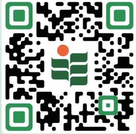
The Education University of Hong Kong (EdUHK)