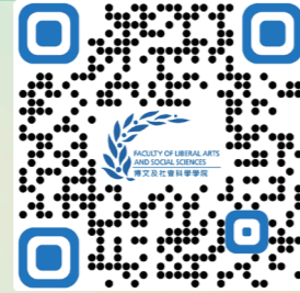
Faculty of Liberal Arts and Social Sciences (FLASS)