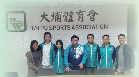
To learn how to operate a sports club in a district

The elective course, Experiential Learning in Sports Industry, offers students the opportunity to learn by doing and engaging in the real-life workplace environment in the sports industry, including non-governmental organizations (NGOs) and/or private companies, etc.