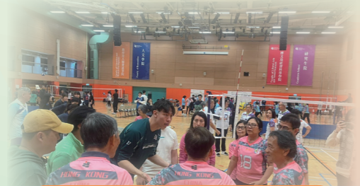
"Promoting Light Volleyball among Middle Aged and Older Adults in Hong Kong" at Hong Kong Light Volleyball Association